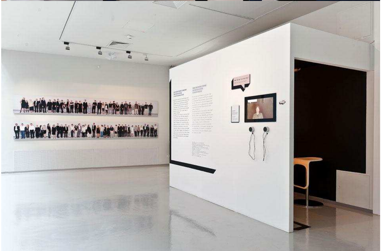
↑ Planet Architects, Seven questions leading to a new permanent exhibition , exhibition at the Jewish Museum, Vienna