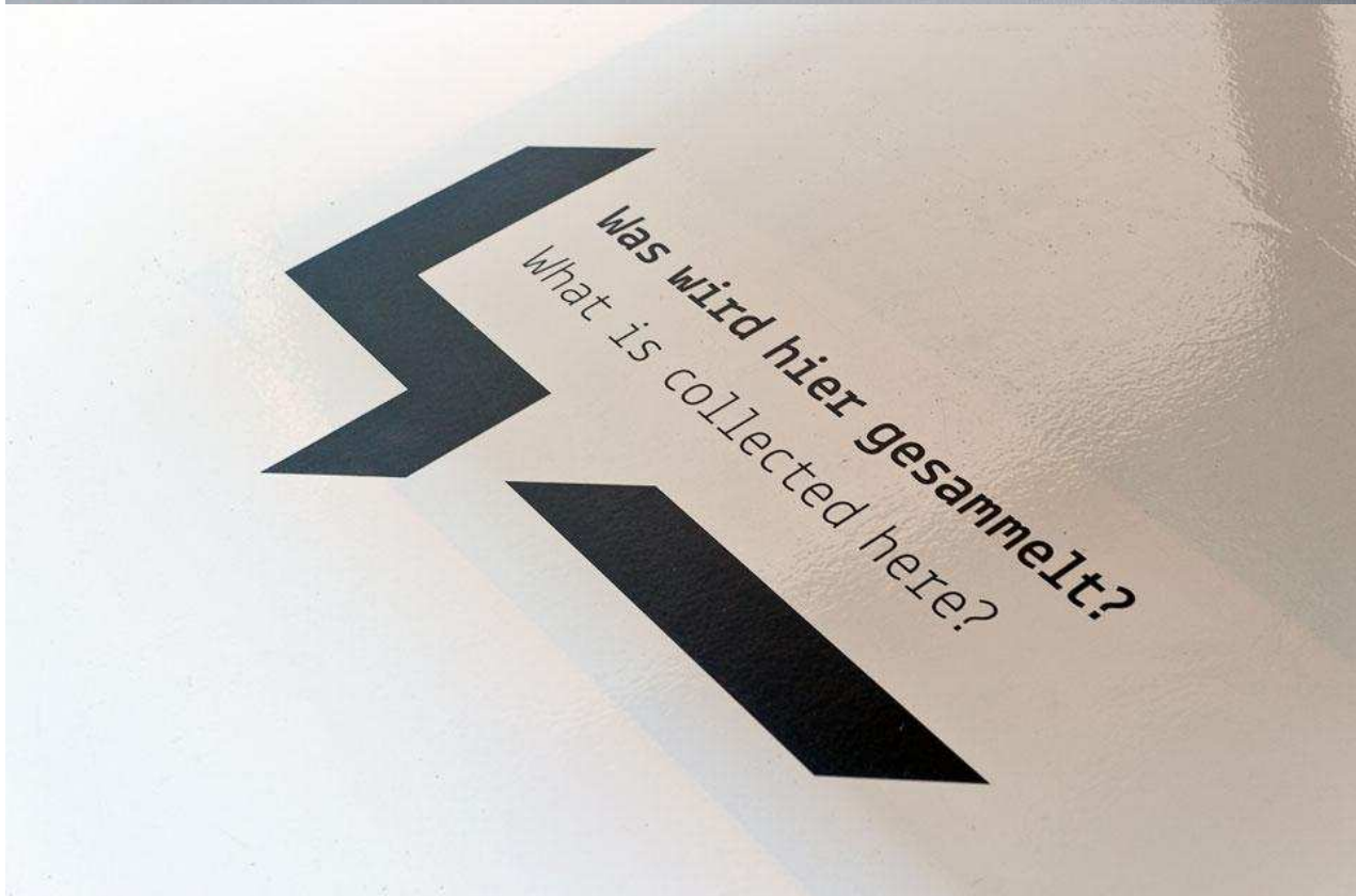
↑ Planet Architects, Seven questions leading to a new permanent exhibition , exhibition at the Jewish Museum, Vienna